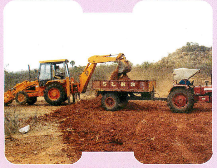
Development works in progress at Sector-V of East City

We would like to clarify to the members that development works are carried out on a cost to cost basis in phases, and these are reviewed periodically till completion and any short fall is to be reimbursed by members. The first phase of developments, like the WBM roads (Kankar roads), cemented rain drains; underground (large dia) sewage lines with manholes and septic tanks; water