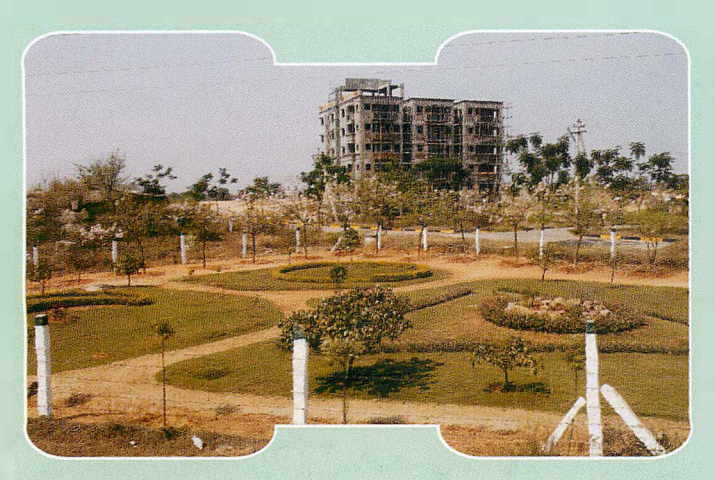
A view of Silver Club apartments with a Well Laid out park at Golden Heights Residency

The finest in living standards now comes within easy reach. Nestled amidst lush green, unpolluted surroundings, Golden Heights Residency is a sprawling campus abutting National Highway-7 to Nagpur, on the Northern limits of Hyderabad, in close proximity to Genome valley, ICICI Knowledge Park, Tata Energy Systems, Shantha Biotech, Bayer India, Apparel export park etc. As the name suggests, Golden Heights Residency offers you the style of living that you have always dreamt of and only 2 km from 12-lane outer