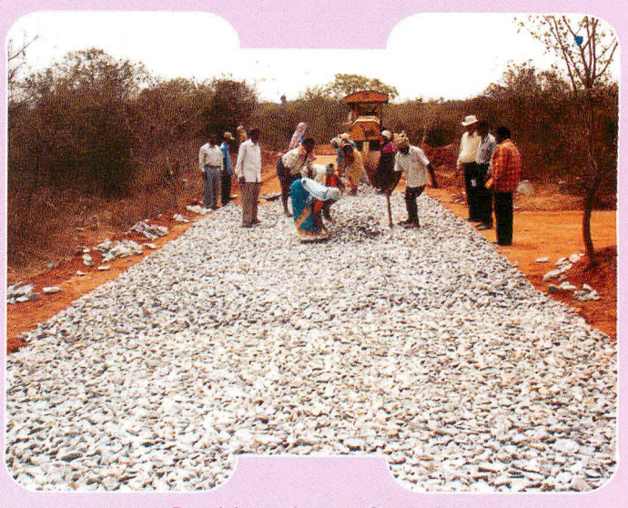
Road formations at Sector V

supply with bore-wells, underground sumps, overhead tanks with (large dia) distribution lines; 3-phase electric supply; avenue plants, fencing etc are almost completed at sectors I, II, III and IV. In the recent past, the company has reviewed the progress of developments, the balance works vis-a-vis amounts collected from members. revealed that the amount estimated years ago, is inadequate to complete the second phase of works like tar topping and Parks. Therefore, necessarily the development charges had to be revised to Rs.125/- for sectors I & II, Rs.150/- for Sector III and Rs.250/- for Sectors IV & V, based on balance works. The members need to remitt the difference of amount between development charges already remitted by them and the revised charges. These rates are applicable to all members at all sectors including those, whose plots are already registered. The additional development charges are mainly required for additional works like "tar-topping" of the 200 km roads and to develop about 200 parks, spread over