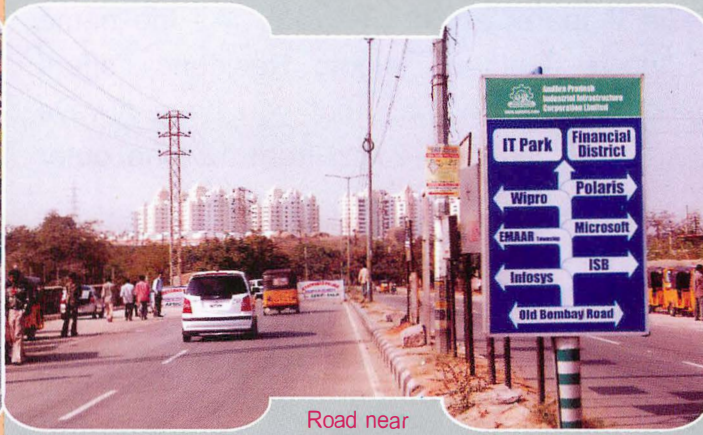
Central Park and RM connecting to growth corridor and International Airport

All development works are completed and plot registration have been carried out in favour of members, who have completed all payments. Original sale deeds have also been handed over to such members. All common areas in this sector had been handed over to Serilingampally municipality in the form of a gift deed, before release of final layout of HUDA. Members in this project may be happy to note that the final HUDA's layout approval has now been obtained by us. We are awaiting our members to build their dream houses in this wonderful project.