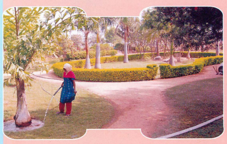
Fully Developed park at Central Park-II

All development works have been completed long back. Plot registrations are being carried out. There have been ULC notices to the earlier land owners of 30 yrs vintage, which are being contested. We are making all out effort to ensure that the lands are cleared from ULC. We are also vigorously trying to obtain the final layouts approval from HUDA. In the meanwhile, members whose plots are yet to be registered, are requested to clear their dues and get their plots registered at the earliest.