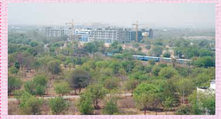
Bird's Eye view of NIMS