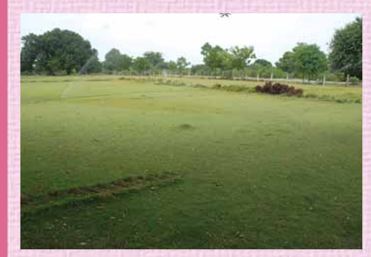
Large Park at Sector - V

16. Sector-V - East City: This sector is under active development and is halfway through in establishment of roads, culverts, rain water drains and underground sewage. Electrical works are in progress and water supply facility will be taken up in 2010. This sector would also be ready for house construction by mid 2010.