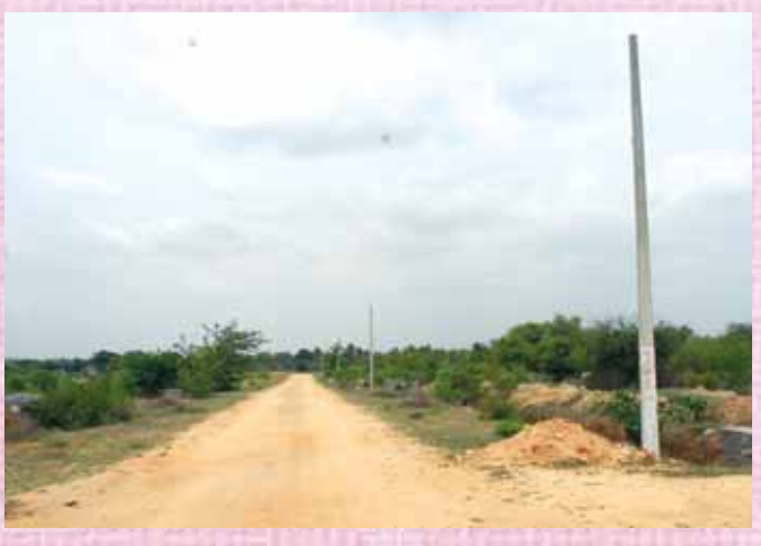
Electrical Poles at Sector - V