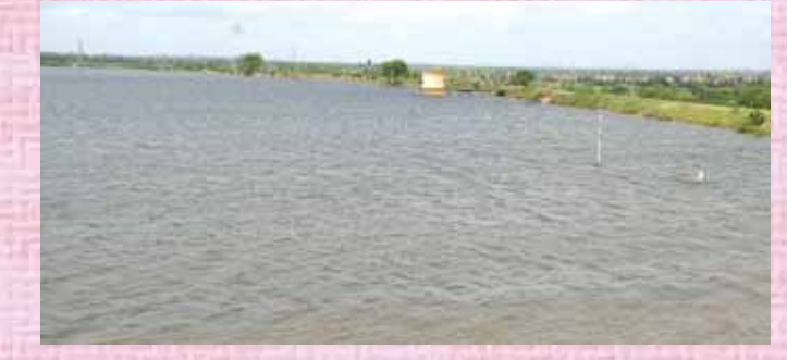
Ever brimming Bibinagar Lake

6. The lands for East City, at an ideal location, with rail & road connectivity to Twin cities, perennial lakes around, electric power station nearby, were being procured right from 1983. Around 1986, when first rumors of Bhoodan Control over the lands in Rangapur (Sectors – I and II) was heard, immediately the permission of AP Bhoodan Board was sought for acquisition of 200 acres, which was duly accorded by the Board officially, on condition that equal extent of land be donated to them elsewhere.