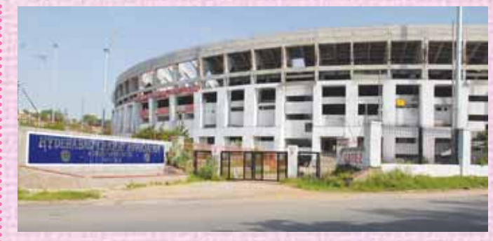
Cricket Stadium on way to East City