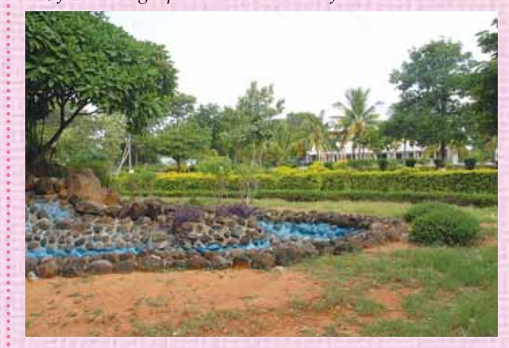
Green Park - East City Sector - II

acquisition of about 200 acres land at Sectors-II and III, for setting up new laboratories for CCMB.