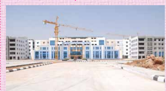
Frontal View of NIMS