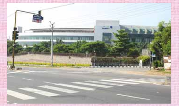
GE Software Park on way to East City

32. From the foregoing, members at East City can realize that, we have to give the final push to EAST CITY, to bloom into a wonderful City, on the lines of Gurgoan, to gallop into a bright future, to make our long cherished dreams to come true. May I hope for your unstinted support, help and co-operation, so that we can all together help to make our dreams come true at EAST CITY.