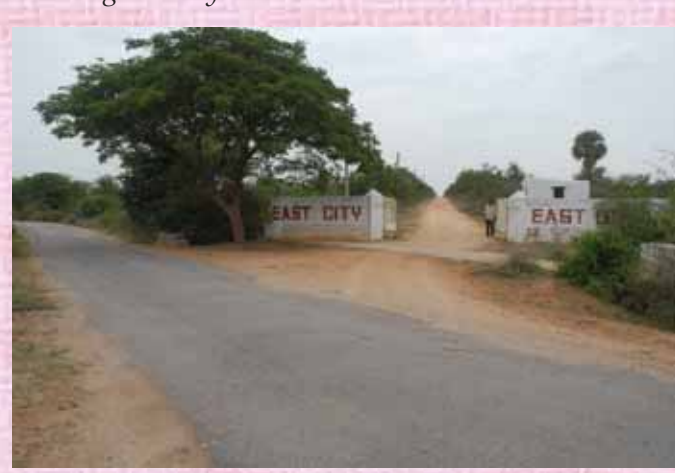
Gate to East City Sector - IV